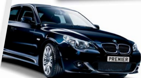
BMW 5 series